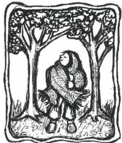
Christ Lutheran Church Prayer Shawl Ministry

A prayer shawl is intended to be a reminder of God's ever-present love and are knitted for those who need comfort and support. The love of Jesus is expressed through a caring embrace—the embrace of a prayer shawl wrapped comfortingly around the shoulders of a person in need. The shawl brings both physical warmth and spiritual support.