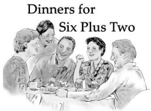
Dinners for Six Plus Two

NAMI Meeting ( Sale Educ. Ctr. ).....Monday, 5:00 p.m. Staff Meeting ..... Tuesday, 10:00 a.m. Church Council Meeting ..... Tuesday, 6:00 p.m. Worship & Music Team Meeting..... Wednesday, 11:00 a.m. Women's AA Meeting ( Parlor ) ..... Wednesday, 1:00 p.m. Choir Rehearsal ..... Wednesday, 3:45 p.m. Handbell Rehearsal..... Wednesday, 5:00 p.m. Preschool Christmas Pageant ( Heinrichs Hall )..... Friday, 9:00 a.m. Offices Closed..... Friday AA Meeting ( Sale Educ. Ctr. )..... Friday, 5:00 p.m.