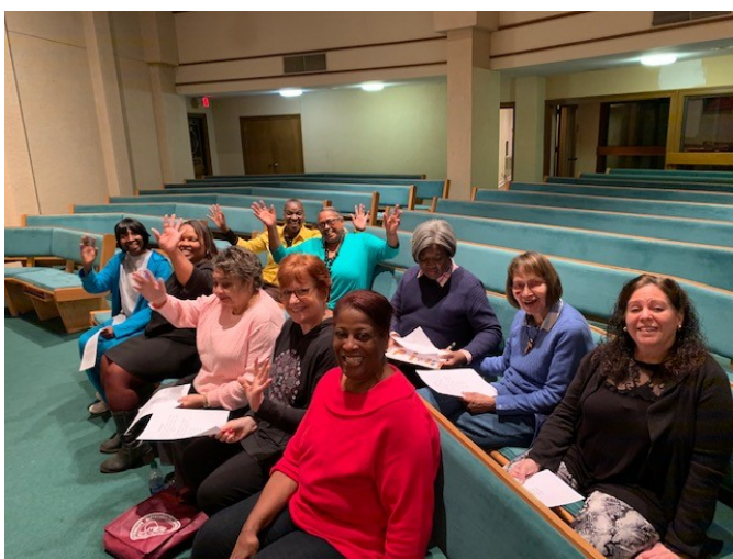
Gospel Choir Rehearsal in the Sanctuary for our April Diversity Weekend.