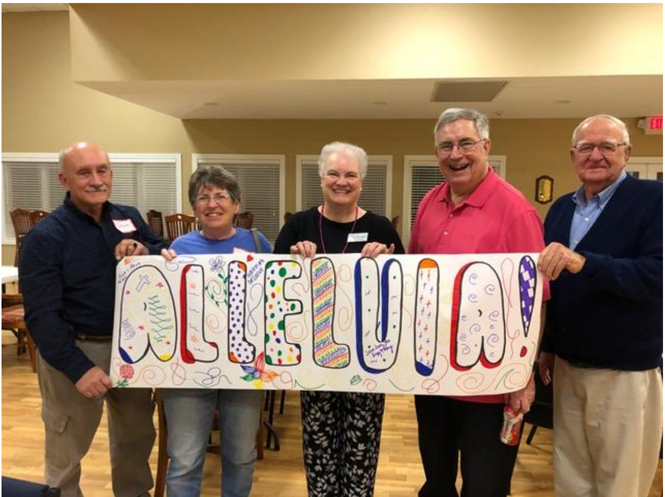
Shrove Tuesday burying of the Alleluia!