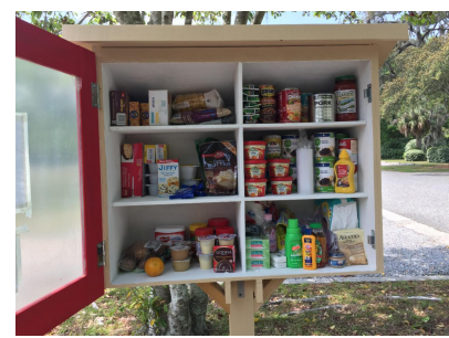
LFP After Food Drive

The Little Free Pantry has provisions to keep it stocked for the near future. Word is spreading that it exists, and items are being taken. The back of my husband's truck was filled with the rest of the donations that we delivered to Deep Well. The pantry manager was thrilled with our delivery. I am sure the Service Ministry Team will repeat this collection in several weeks. The need is so great!