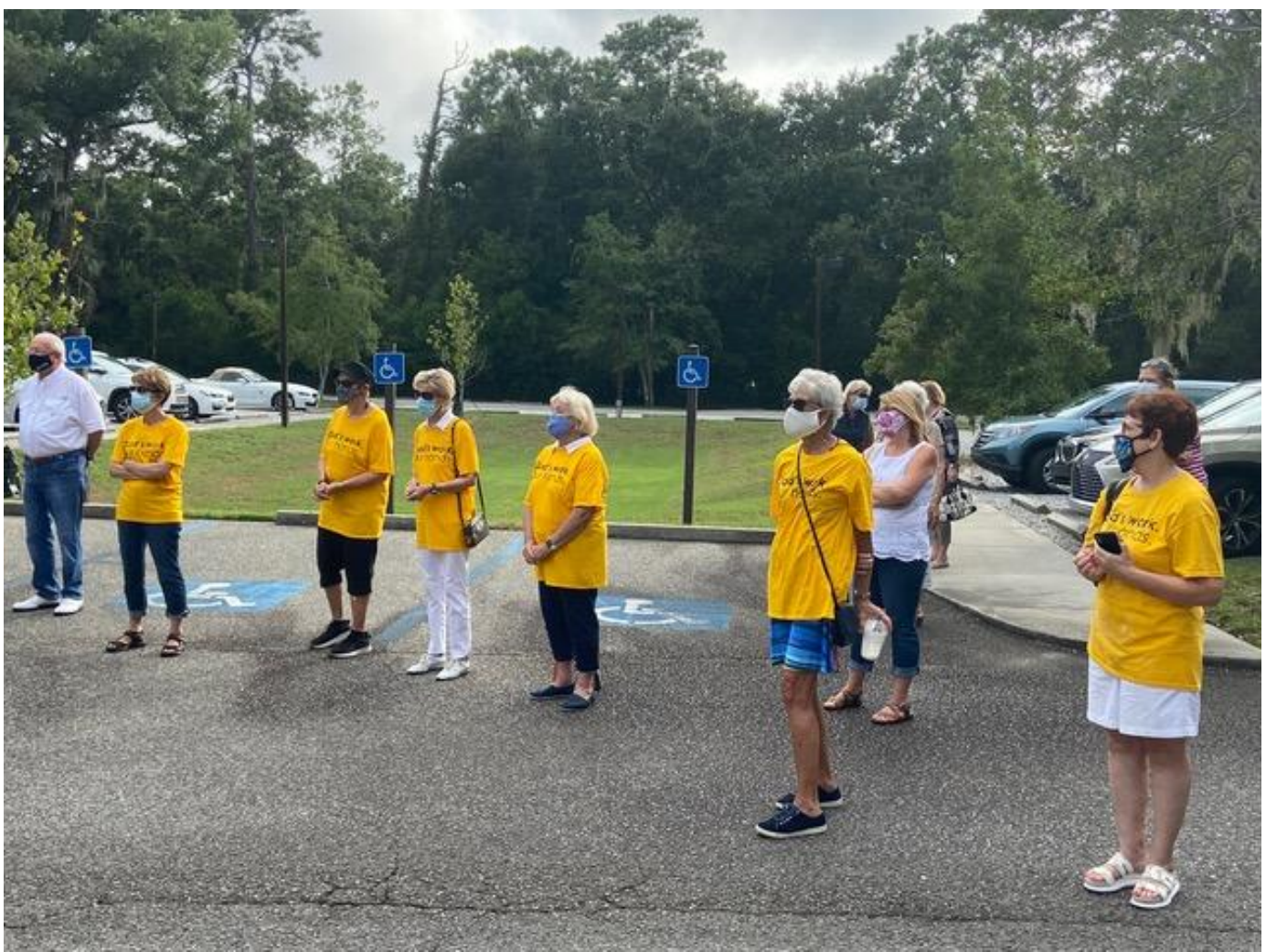
Many members were present to view our groundbreaking ceremony, properly masked and socially distanced.