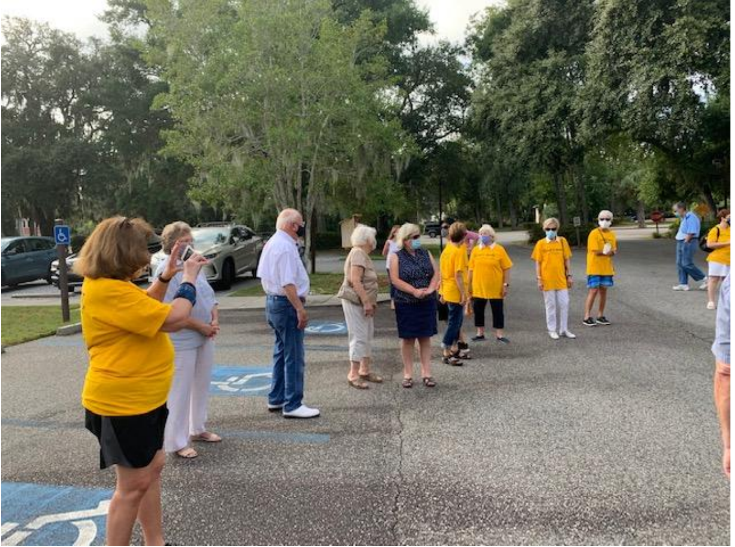
Members getting ready to applaud the start of our project.

We should be started soon. Town permits should be in hand shortly and equipment will be positioned to start on the exterior front of the church.