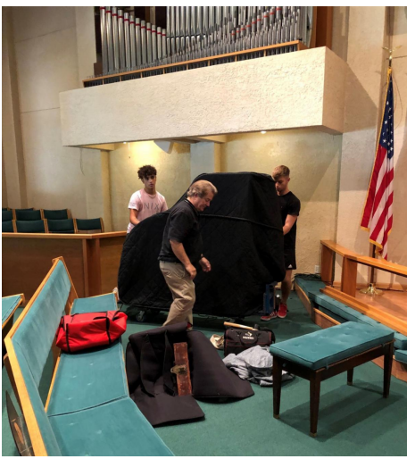
The Piano being prepared to move.