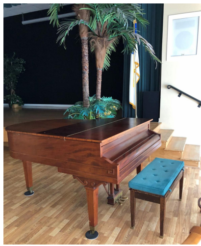
Piano in it's new Heinrich's Hall home.