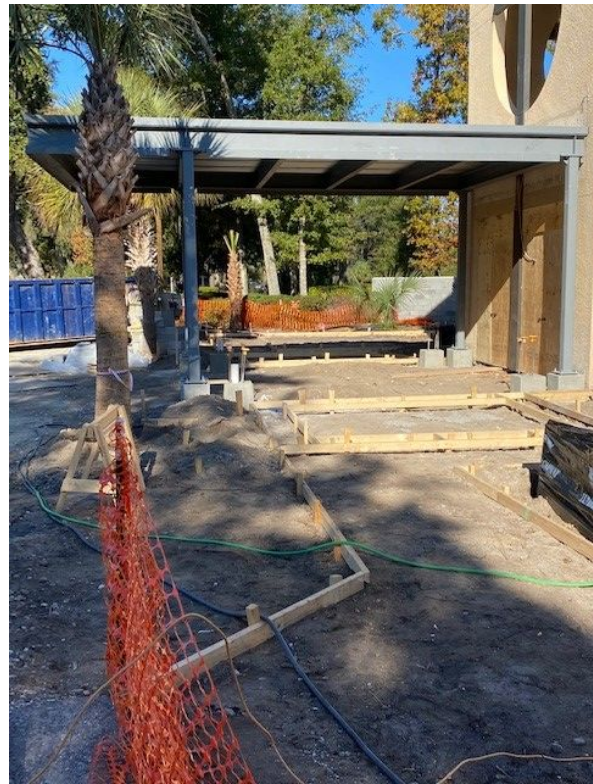
Side view of front canopy in place.

Canopy has been erected at front entrance