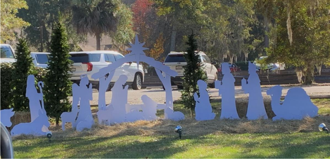
Away in a Manger