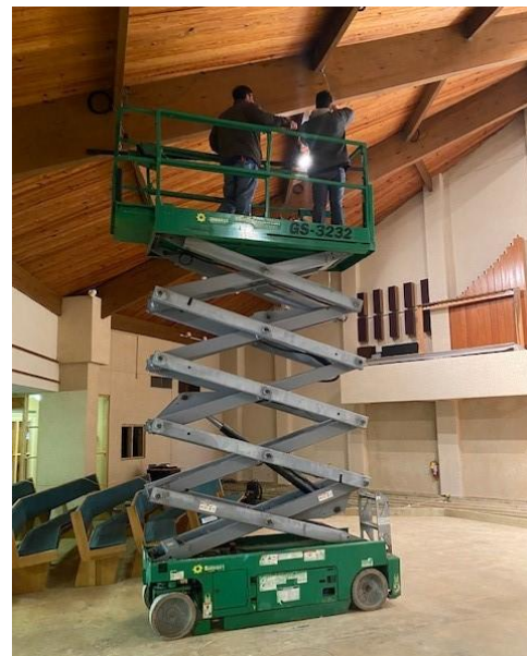
Working on the wiring to feed the new lighting system in the sanctuary.

Things continue to move right along with our Renovation. Wiring began this week in the sanctuary and our front portico entrance continues to make progress.