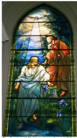
The Baptism of Christ, by Louis Comfort Tiffany Stained glass window at Brown Memorial Presbyterian Church, Baltimore