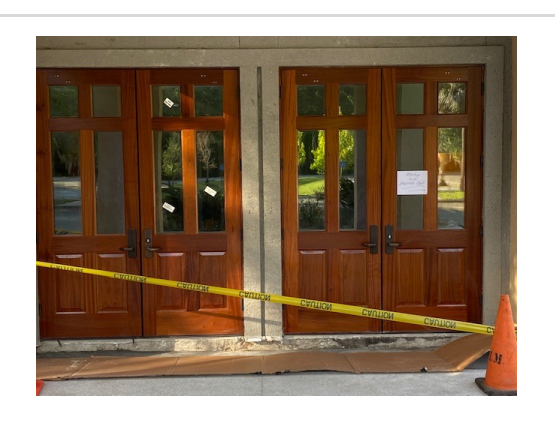
ALMOST BUT NOT YET!