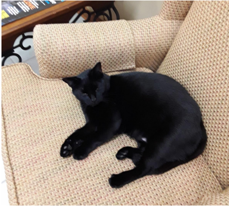
The Office Cat "Lucky"

Sunday, October 1, 2023 we will have a special worship and blessing for your pets