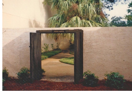
The Prayer Garden, in 1986 without the columbarium

Did you know that we have a cemetery at Christ Lutheran Church? Well, it's not a cemetery, but it is a columbarium, a place where the cremated remains of our loved ones are housed. It's right outside the back door of the sanctuary near the doors to the sacristy.