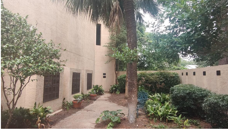
The Prayer Garden after our clean up More improvements are coming!