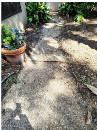
This narrow walkway is leaning toward the sanctuary, which creates a drainage problem. The narrow walkways are the only places available for people to gather.