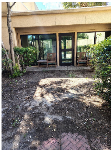
This courtyard could be wonderful outside gathering space, but it is not currently usable.