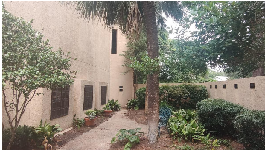
The Prayer Garden today. More improvements are coming!